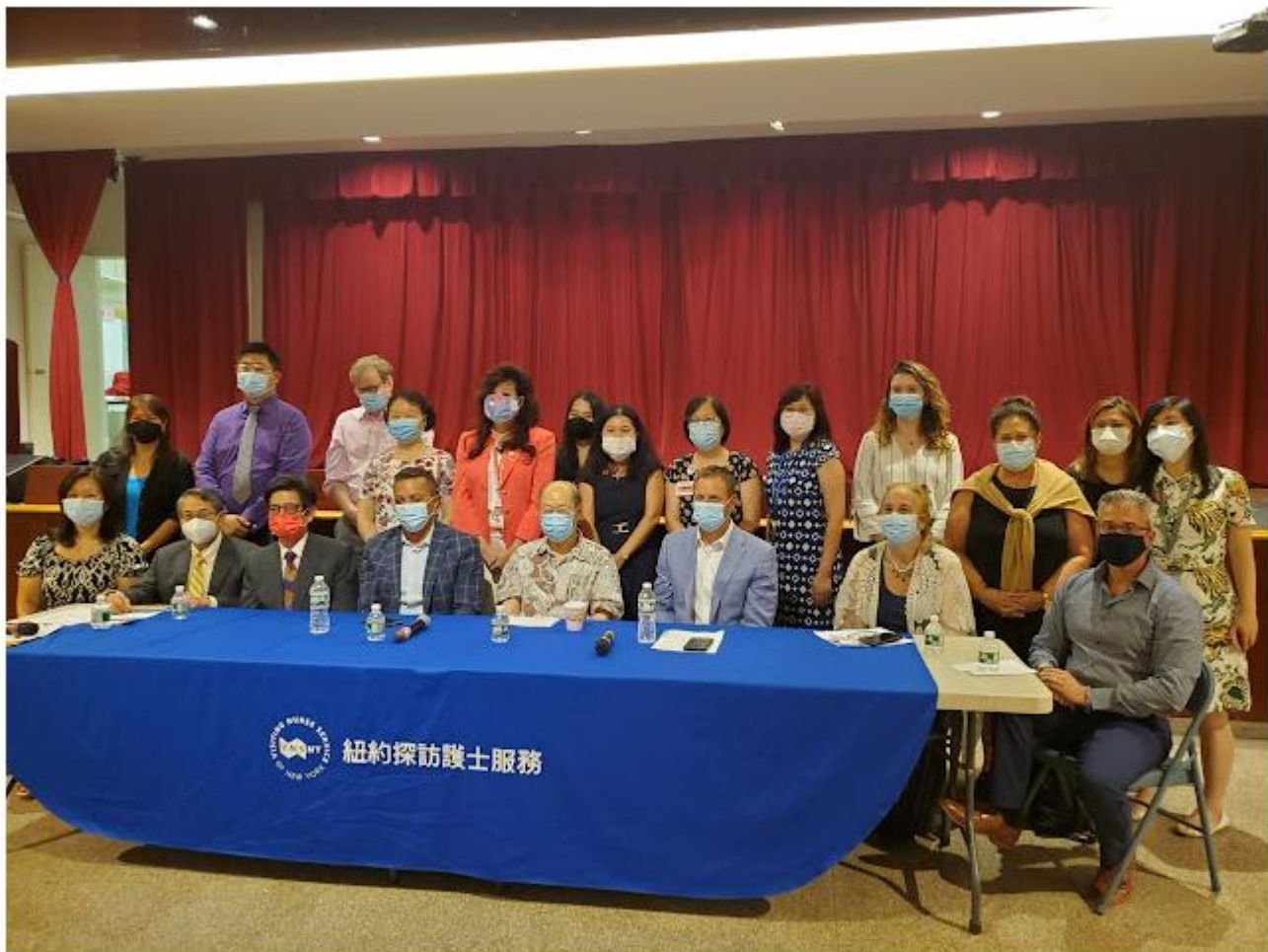
Visiting Nurse Service of New York and the Chinese Consolidated Benevolence Association gathered in Chinatown Friday.